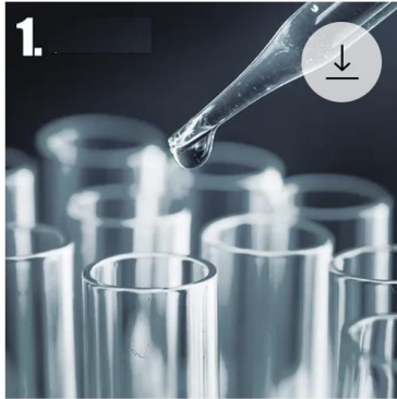
Irrigation Water Analysis