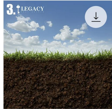
Available Soil Nutrition Analysis